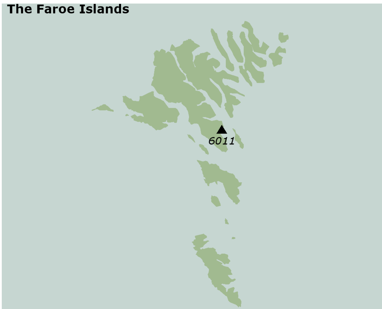
Figure 1. Station position, 06011 Tórshavn, The Faroe Islands. The official WMO station number for Tórshavn consist of 5 digits “06011”. On the map the station identifier “6011” is used for Tórshavn. This identifier is used in the “old” data sets before 2014. In the “new” data sets “00” is added to all station identifiers, so they consist of 6 digits i.e. 601100 for Tórshavn.