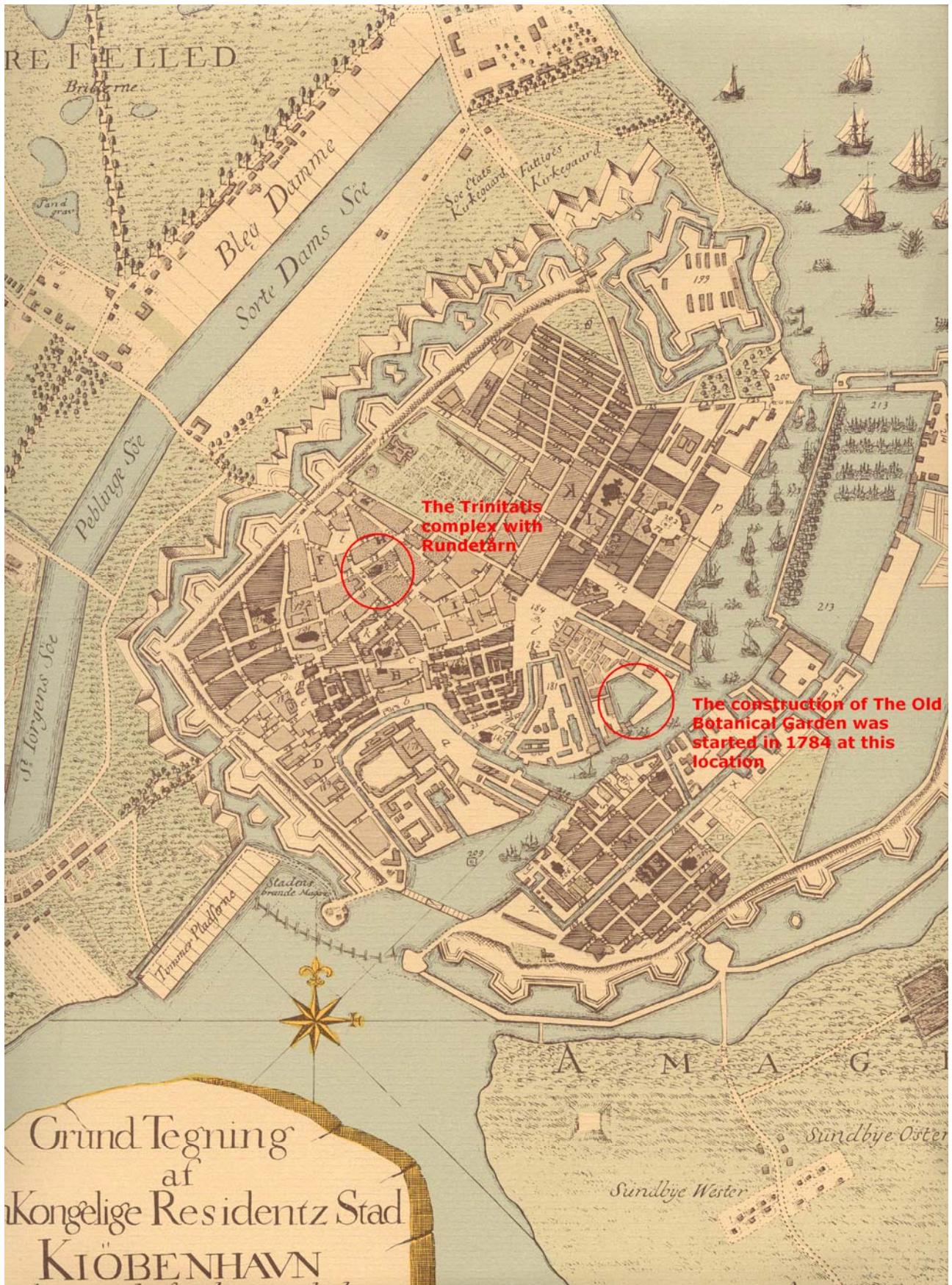
Figure 1. Old map of Copenhagen 1784. The locations of Rundetårn and The Old Botanical Garden are shown. In 1784 the first steps were taken in the construction of the The Old Botanical garden.